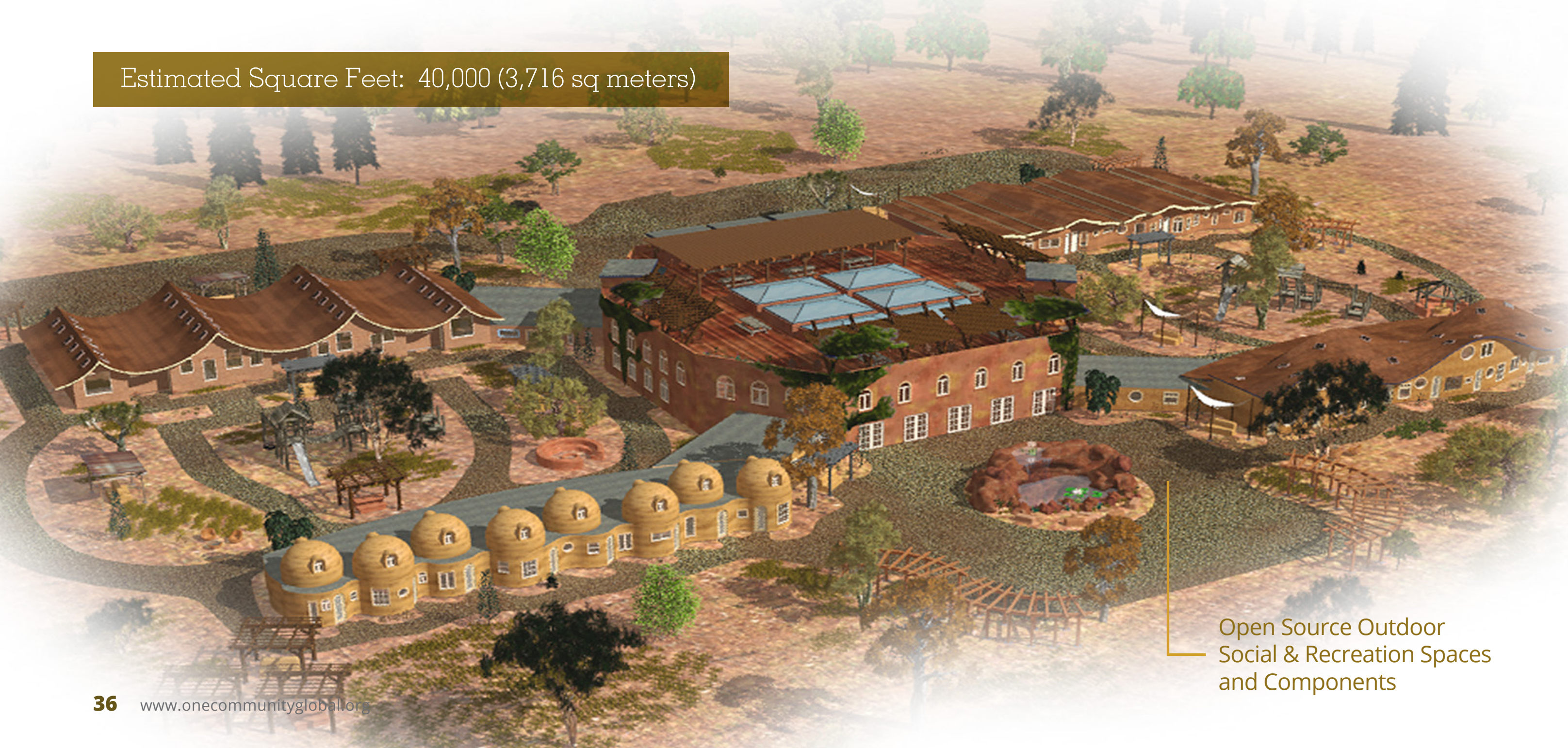
Open Source Outdoor Social & Recreation Spaces and Components

View the Online Open Source Hub: www.OneCommunityGlobal.org/Cob-Village