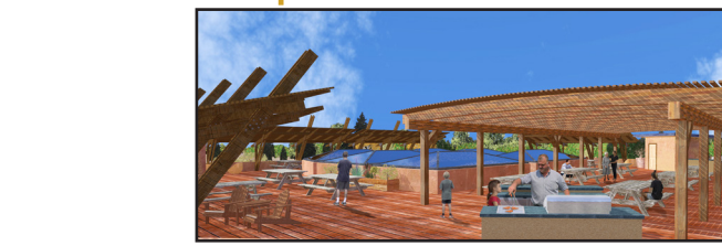
Rooftop Dining Area