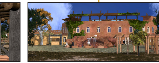
Front Entertainment Area